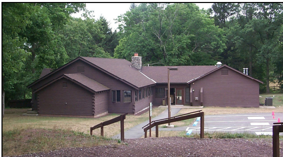
Main Activity Center

Echo Hill was established in 1836 as a farm, consisting of the stone house, a barn, chicken coops, and a peach orchard. In 1936, the property was purchased by Robert and Hermia Lechner, who established a summer camp for boys. They called their facility “Camp Echo Hill.” The first summer 65 boys attended. The camp was expanded the following year to permit girls. During the transition from farm to summer camp, many of the existing structures were demolished or converted to new uses. Salvaged beams from the barn were used in the boys’ dining hall (what is now the Main Lodge). The orchard was cut down and replaced by 200,000 evergreens by the Civilian Conservation Corps in 1939. In 1943, the Lechners acquired the Stanton Station Railroad Station from the Lehigh Valley Railroad for $75.00. This structure was transported to the property and converted into the girls’ dining hall (now known as the South Activity Center). The Lechners’ home in the stone farm house served as the camp infirmary for many years. The Lechners constructed a pond for children to learn to swim. They retired from the camp in 1959 and sold the operation to a local church. The county acquired the property in 1974. Today, Echo Hill still continues its tradition of teaching children about nature through the Summer Nature Program and other activities.