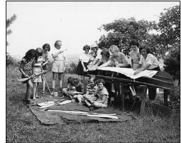
Building a boat, Camp Echo Hill, circa 1950