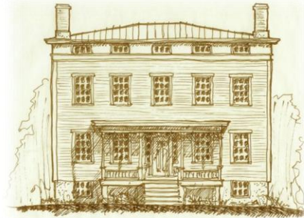
Headley House Annandale