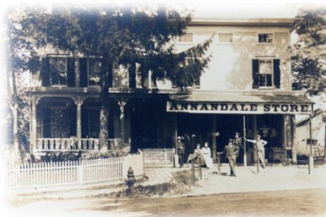
Annandale General Store