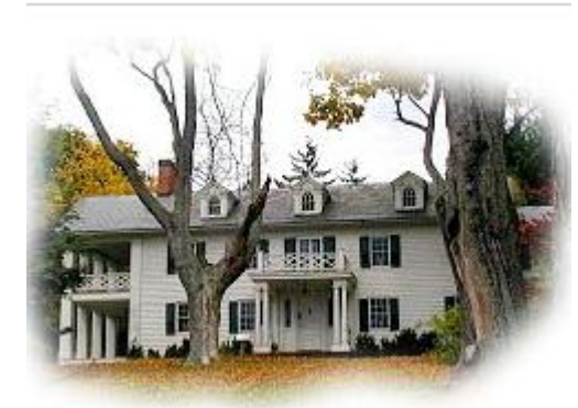
The Beaver Brook Homestead in Annandale

The purpose of the Commission is to promote the conservation of historic sites and districts, and to safeguard the heritage of Clinton Township through education and preservation of the elements of its cultural, social, scenic, economic, and architectural history.